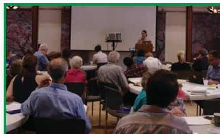
UUs from X states came to Washington for UUJEC's Sept. 2019 conference for training and action to bring home and further their support of the new CS/AI, Build the Movement for a Green New Deal.

Have questions or need more information? E-mail us at uujec@uujec.org