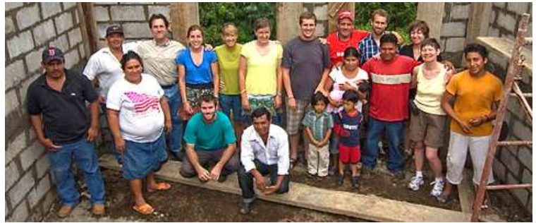
UUCW members in Nicaragua

Since 2004 over 150 adults and youth have participated in the 10 day house building trips to Nicaragua (through an organization called Bridges to Community) and seen first-hand the poverty of a third world country. In the program they work side by side with the Nicaraguans in the villages where the houses are being built and reflect with them on issues of first world - third world justice. The members come back with a deeper understanding of their own privilege and want to take action - both on local social justice issues and in leadership in the church. As a result, the majority of Board members since 2004, have the Nicaragua experience and are much more willing to take bolder stands on social justice issues that come before the board than was previously the case.