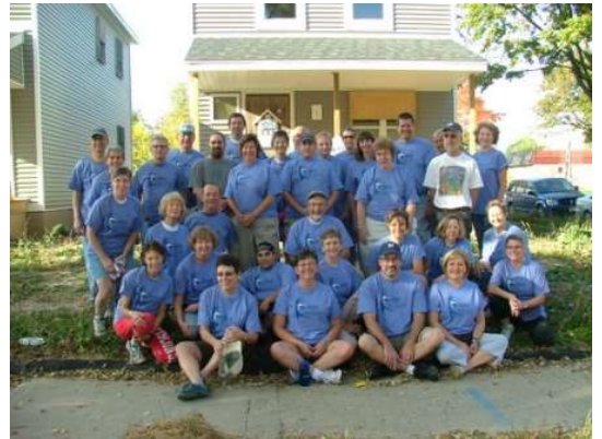
UUCW Members working with Habitat for Humanity

However, I would say that it was the Escalating Inequality Study Action issue that helped us really bring this vision of social action to a reality. Members could recognize in the Escalating Inequality theme how our own middle class lifestyle is threatened by the existing system of economic and racial inequality - and could also see how our own privilege is sustaining those systems. As a result of offering both targeted educational programs along with a variety of options of working for specific systemic changes with partner organizations more members are engaged in work for economic and racial justice. This is creating an important feedback loop - the more members engaged, the more members encourage others to get engaged, the more experience and understanding in the congregation results in a willingness by the congregation to take bolder steps.