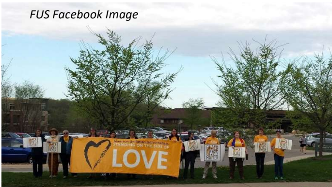
FUS Facebook Image

We have a Social Justice Roundtable quarterly, and we can see that our ministry teams are understanding the intersections of their work. Justice leadership is broadening to include young adults, parents of young children, while members of all ages keep extending beyond comfort zones in experiences and skillsets. People talk about race, about incarceration, about housing -- and members call each other into conversations about how to make our community really work.